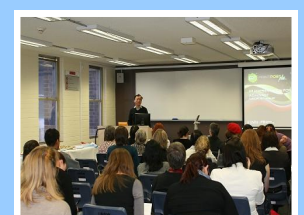
Fuji Xerox August 2009