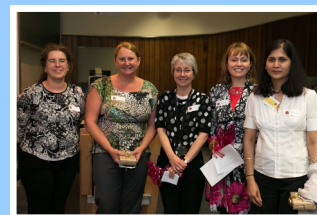
End of Year Event 2012