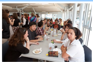
End of Year Event 2011

To send emails to members: admin-network@lists.unsw.edu.au