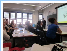
Excel 1 October 2012